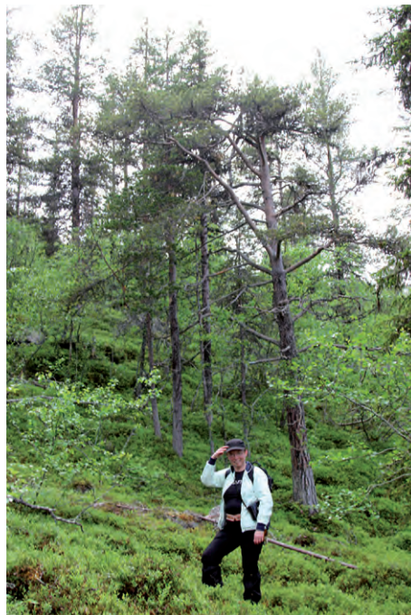
Mixed forest at the foot of Ájlisvárre.

Animals: Around Ájlisvárre there is elk, reindeer and fox; in rare cases you can catch a glimpse of bear, lynx and wolverine. Otter used to be common in the water-rich area, but they all but disappeared from the 1960s and onwards, likely due to hunting and environmental toxins. The population is, however, well on the way to recovery here in the area around the Pite river.