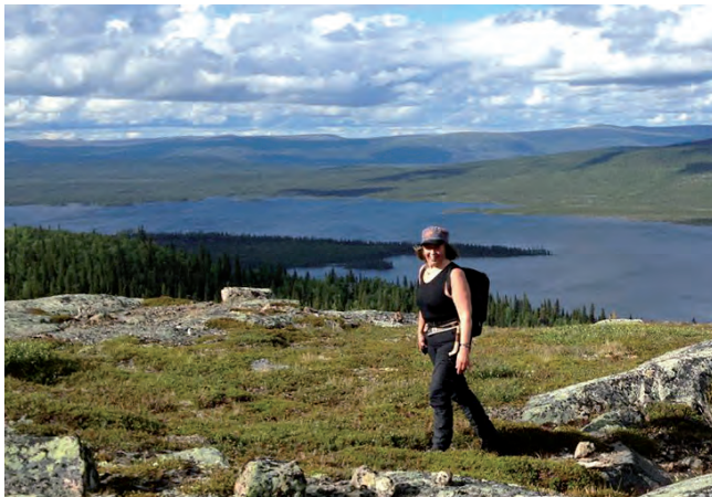
View from Ájlisvárre's north-eastern side with Lake Stor-Mattaure and the mountain area Siejdvárre.

Fishing guide: Arjeplog – a guide to a fishing paradise is available at the Tourist Office or www.arjeplog.se .