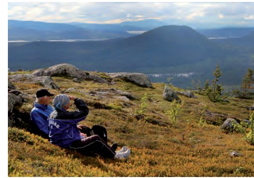
View from the north side of Ájlisvárre. The nearest peak is Suobddekjávve, 704 m.a.s.l. Northwest of it are lakes Rahppen and Lábbás.

"Yes, the herding girls of yore didn't tire, nor fall asleep, they weren't afraid to get their shoes and shoe ribbons wet, they wouldn't let anything stop them, they just herded and joiked, herding, herding".