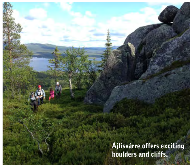
Ájlisvárre offers exciting boulders and cliffs.