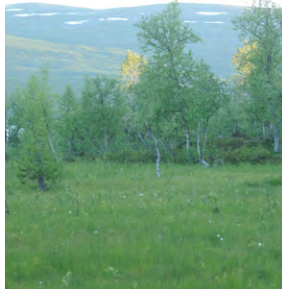
Mountain birch. On Stiehpaltjähkká there's sloping marshland.