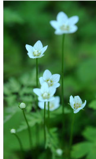
Grass-of-Parnassus Parnassia palustris

Shelter: None, but nearby you have Camp Polcirkeln with a shop, Vuoggatjålme with restaurant and cabins and Sandvikens Fjällgård with cabins and a shop.