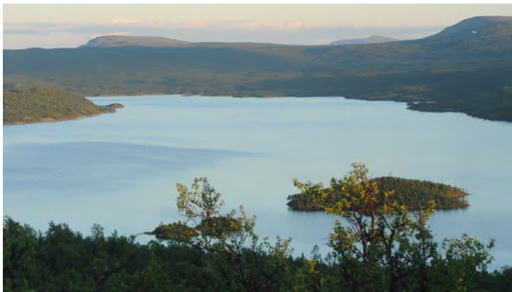
View to the south: Sädvvájávrré is located in the upper part of the Skellefte River and is used as a reservoir. The lake has been dammed in several stages in 1942, 1953 and 1985. The water level varies between 460.70 and 470 m.a.s.l. The volume of the reservoir is 605 million m 3 .