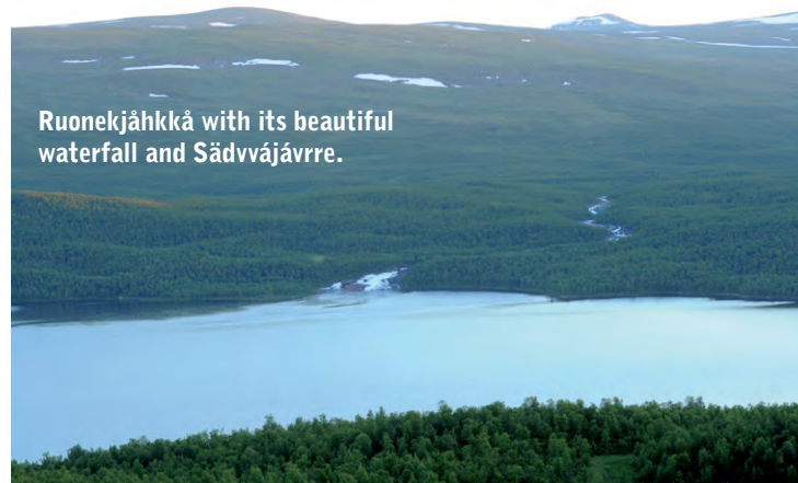
Ruonekjåhkkå with its beautiful waterfall and Sädvvájávrrre.

Cabins, caravan and tent pitches and a shop. Tel +46 (0)70 694 06 70 / +46 (0)70 559 01 64. www.sandvikens.se