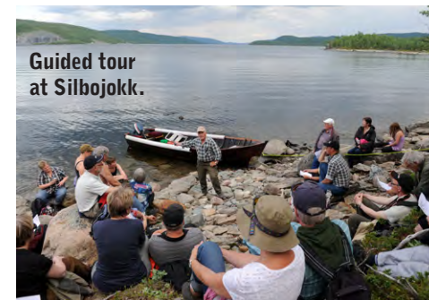
Guided tour at Silbojokk.