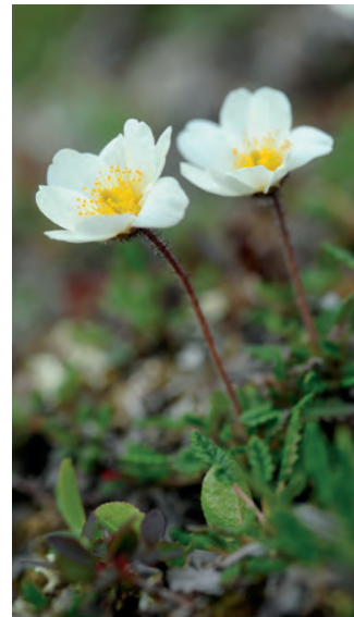
Grows in abundance by the top of Stiehpaltjåhkkå – mountain avens Dryas octopetala .